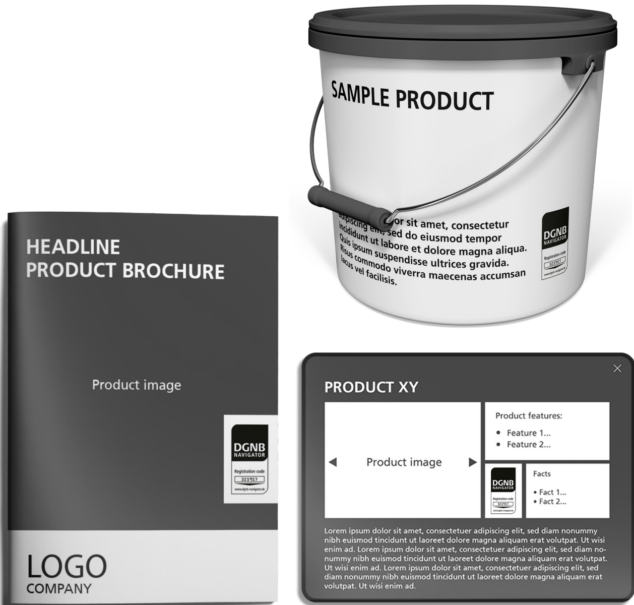
Example of how the DGNB Navigator label is used in a brochure, on a product website and a product.