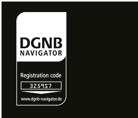
The DGNB Navigator label in the negative version for use on a dark background