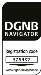
The DGNB Navigator label