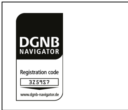
The DGNB Navigator label in the standard version for use on a light background

The DGNB Navigator label has a unique product-specific code. Users (architects, planners, auditors, etc.) can access the DGNB Navigator online from any location and view extensive product information by entering this code.